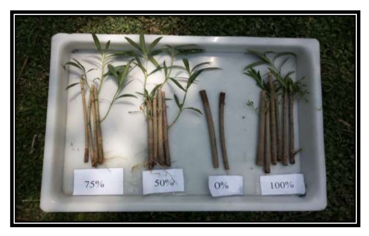
Fig: 2. Cuttings of Nerium indicum L. grown in different concentration of roadside soil after 35 days of experiment