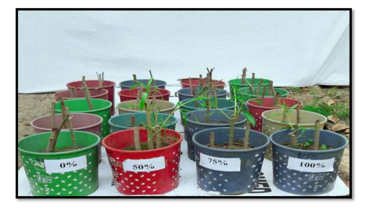
Fig: 1 Nerium indicum L. grown in different concentration of soil at the start of the experiment